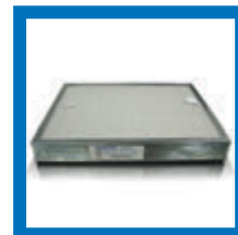
F072-GPC Chemical Filter