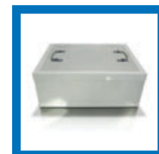
AG097 Chemical Filter