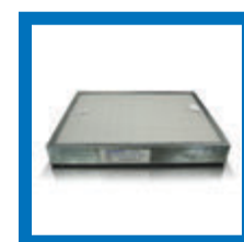
F074 Medical Grade HEPA