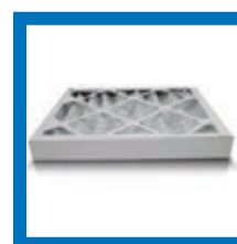
F071 Pleated Pre-filter